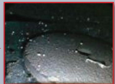
After pressing anti-reflection button (with mirror)

The anti-glare function of a VGA resolution probe