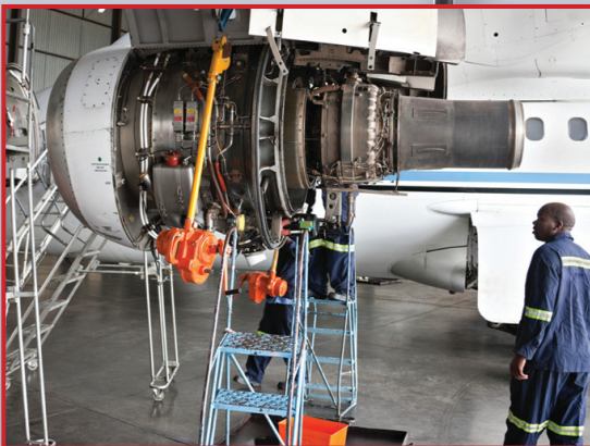
An articulating probe is a must for inspecting densely packed aircraft engines

Compatible with General's DCS1600, DCS1600ART and DCS1800 high-performance video borescope inspection systems, H16 handheld recording console and DCS1800-TR wireless probe handle/controller